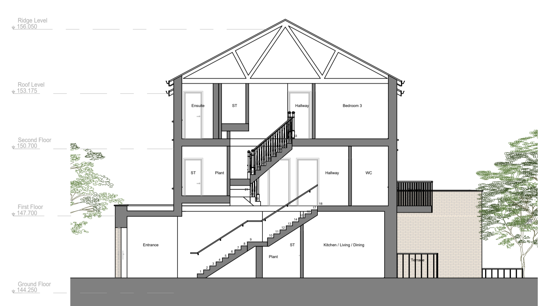
Section C-C SCALE: 1 : 100