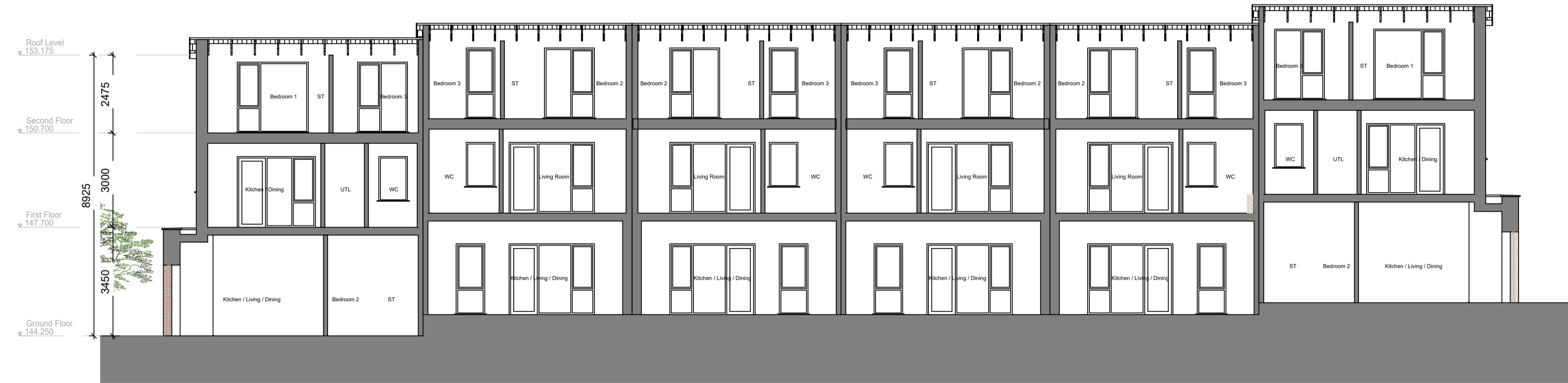
Section A-A SCALE: 1 : 100

THIS DRAWING TO BE READ IN CONJUNCTION WITH ALL ARCHITECT'S DRAWINGS, SPECIFICATIONS CONSULTANTS' DESIGN TEAM DRAWINGS AND SPECIFICATIONS.